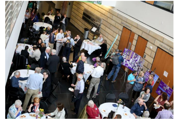
Friday After Clinic Fundraiser

“The Free Clinic provides quality, comprehensive medical and dental care for the uninsured and underinsured in Johnson County and surrounding areas.”