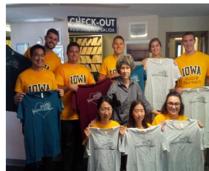
College of Public Health Volunteers